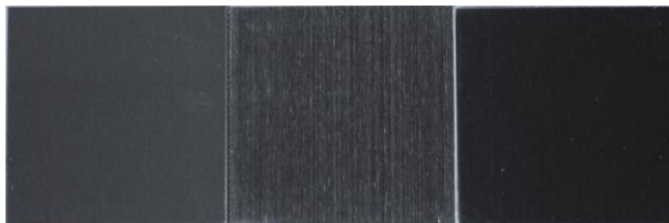
Dom. A Co.'s Black Our conventional Black NINJA BLACK96

Light absorption about 96% (average reflection rate about 4%), NINJA BLACK96 is the blackest stainless steel.