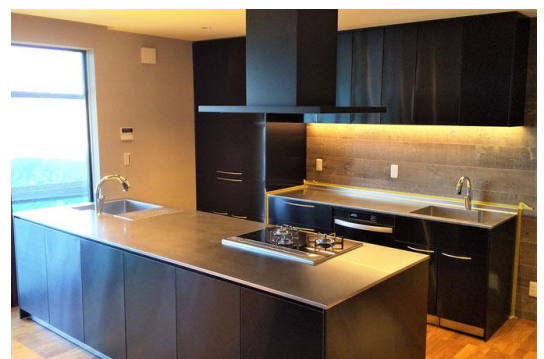
Kitchen cabinet panel